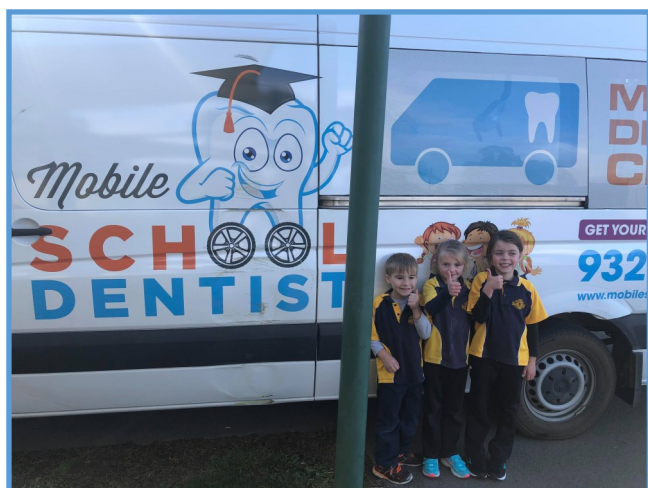
Pictured Above: Prep—1 children excited about their visit to the school dental van.